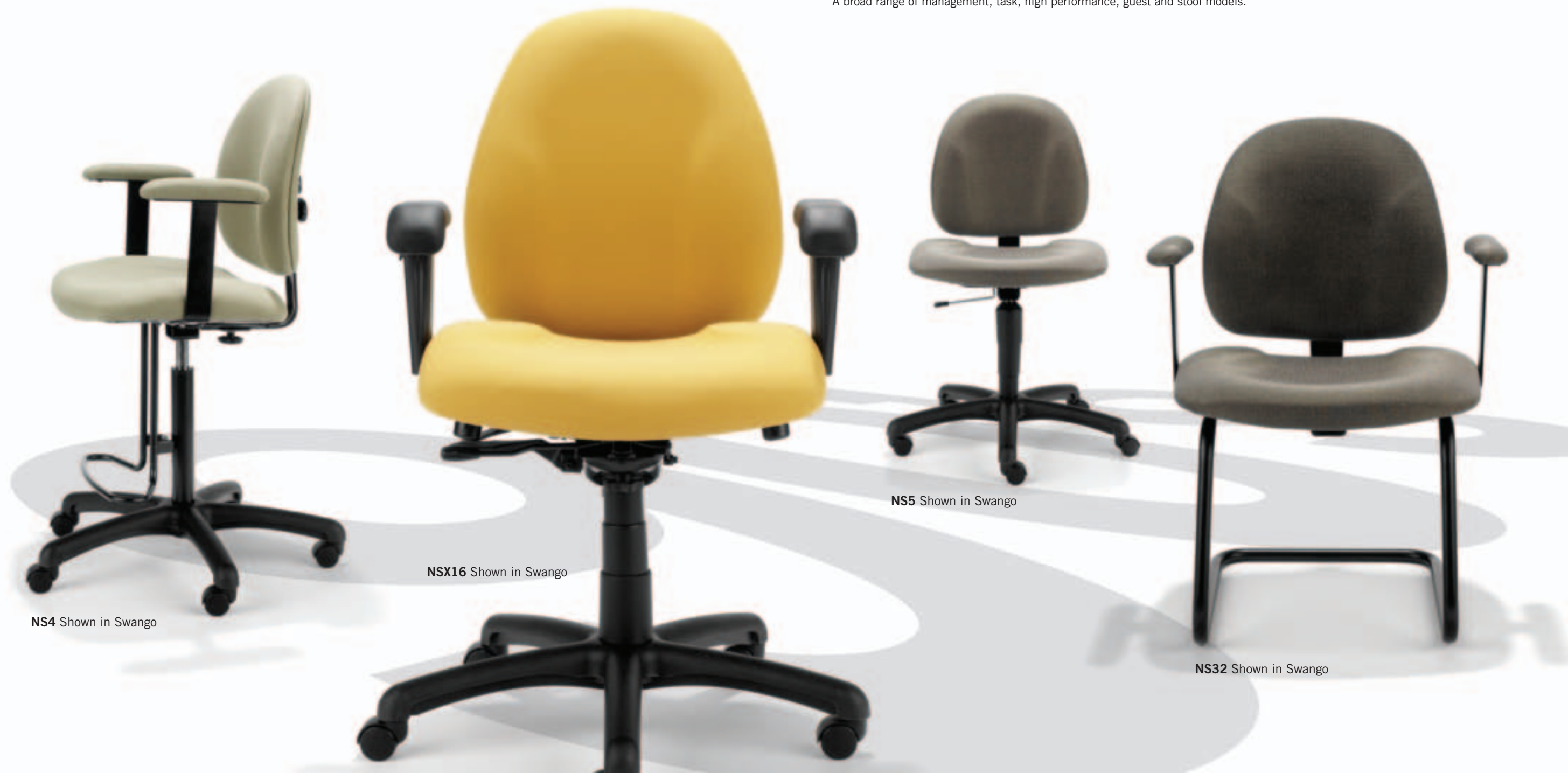
NS4 Shown in Swango

A broad range of management, task, high performance, guest and stool models.