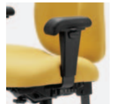
Height and width adjustable arms

United Chair® products comply with ANSI/BIFMA X5.1-2002 and ISO 14001:1996 standards. Information contained herein is subject to change without notice.