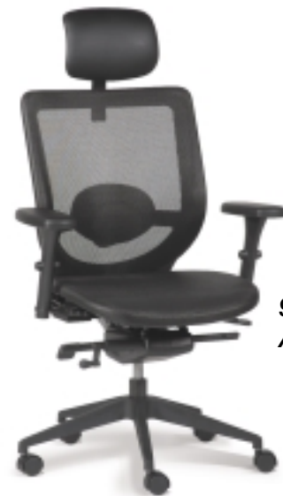
9895JH AQUA III