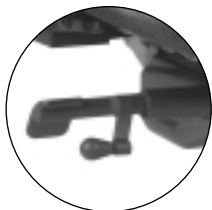
Side knob tension adjustment