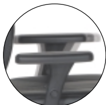
Adjustable arm pads*