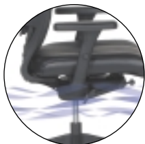
Floating synchro mechanism