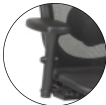
Height and width adjustable arms*